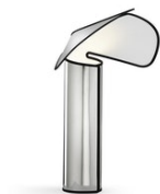
Table lamp composed of a reflecting body in aluminium in 3 colour variations, finished internally with an opaque white plastic film and folded and closed via hooks riveted to the sheet metal. A coloured seal in moulded tpu runs along the entire profile of the body. The internal base in extruded aluminium is attached to the body for stability and it also supports the bulb socket. The power cable has a dimmer switch to adjust the brightness. Usable cable length: 1.9 m