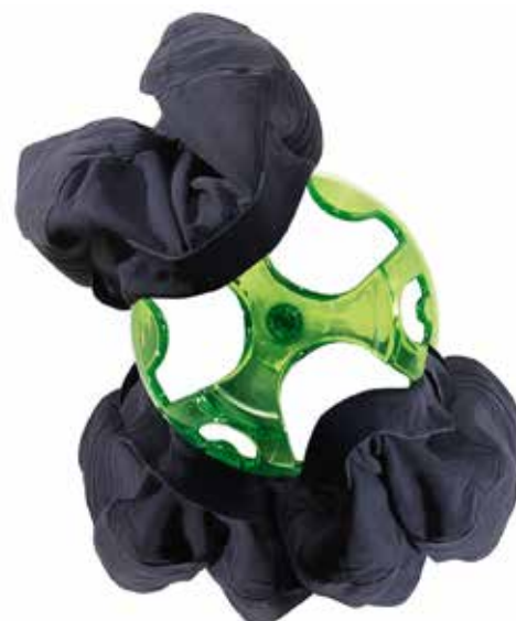
Detail head seen from above