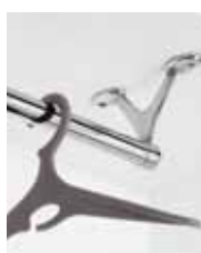
Ambrogino ceiling fixing