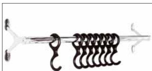
Ambrogino code 1551