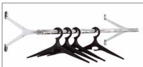
Ambrogio code 1546

Description: modular coat hanger system consisting of a wall-mounting cast enbloc element made from polished aluminium, each element has two support bases, each with a hole for wall/ceiling mounting and a front cylindrical element with a hole to mount the hanger rail using M8 stud bolts or M8 terminal screws M when the bars are mounted continuously. The coat rail is made from 28 mm diameter chrome-plated steel tube with threaded inserts at the ends to fasten the screws or stud bolts.