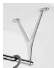
Ambrogio ceiling fixing