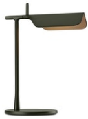
Table and floor lamps providing direct lighting with adjustable head. Body in painted pressofused aluminium. Multi-led diffuser in specially designed PMMA to avoid the Multi Shadow effect and dazzle. Head rotation from \pm 90^\circ .

Designed by Edward Barber and Jay Osgerby