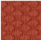
Visual fabric 13 Colors